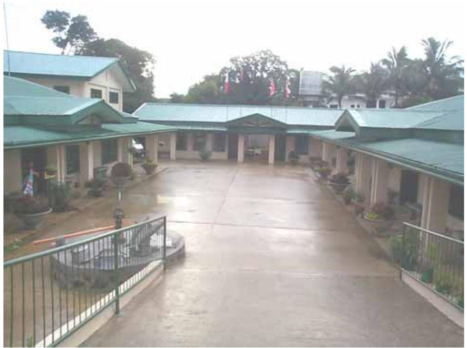
The Rehoboth Children's Home Current Facility