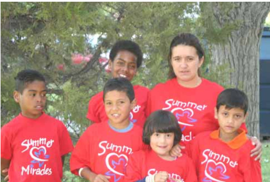
The Colombia Contingent Escort & Kids