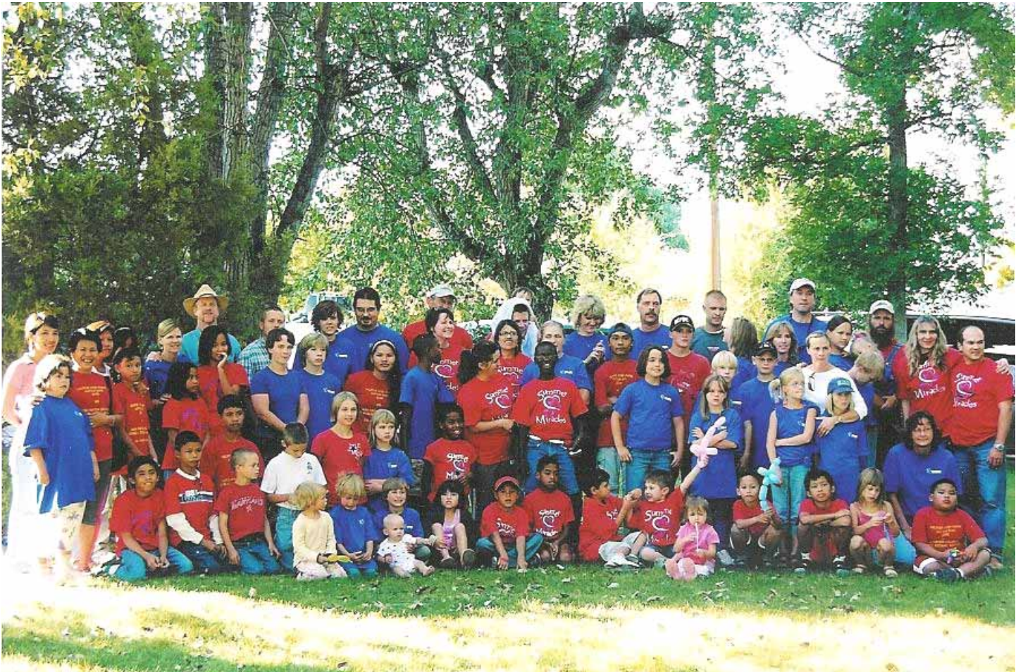
Summer Miracles Host Families and Children