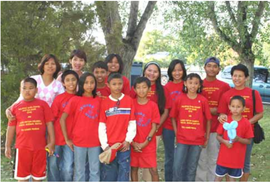
The Philippine Contingent Escorts & Kids